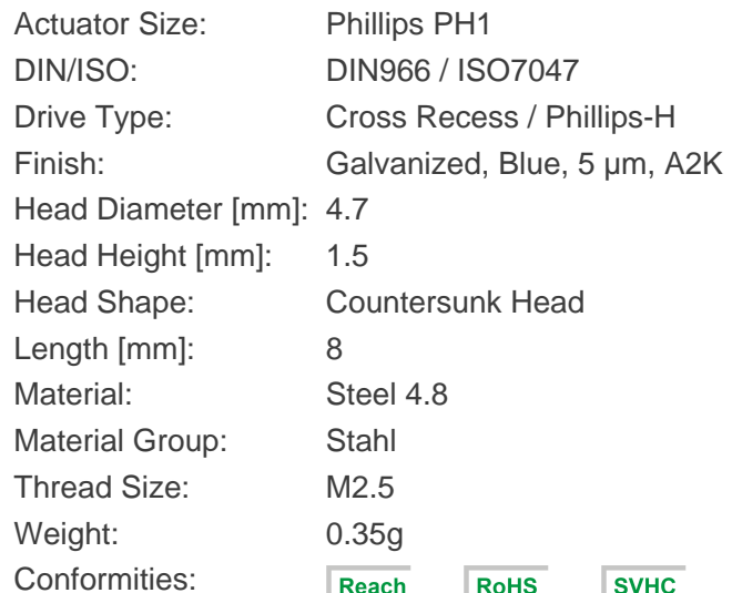
Image may be similar